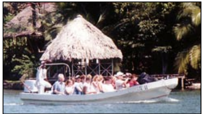
Visiting a church on the Rio Dulce.